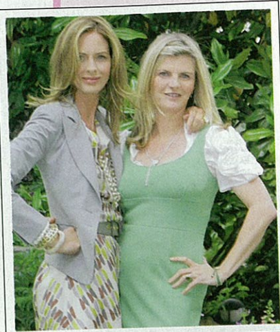
GURUS: Trinny and Susannah at the launch of Style in the City in Dublin

They later hit it off, however, and teamed up in 1994 to write Ready to Wear , a popular style guide for the Daily Telegraph , and so the Trinny & Susannah brand was born.