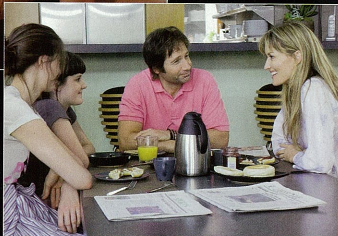
SHOW: Despite the sex scenes, Duchovny claims Californication is a family show and (top right) with real wife Tea Leone