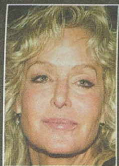
FITTING: Farrah Fawcett