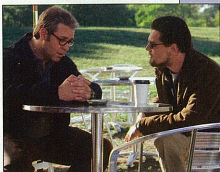
HARD HITTING: Leo and Russell Crowe in new hit flick Body of Lies